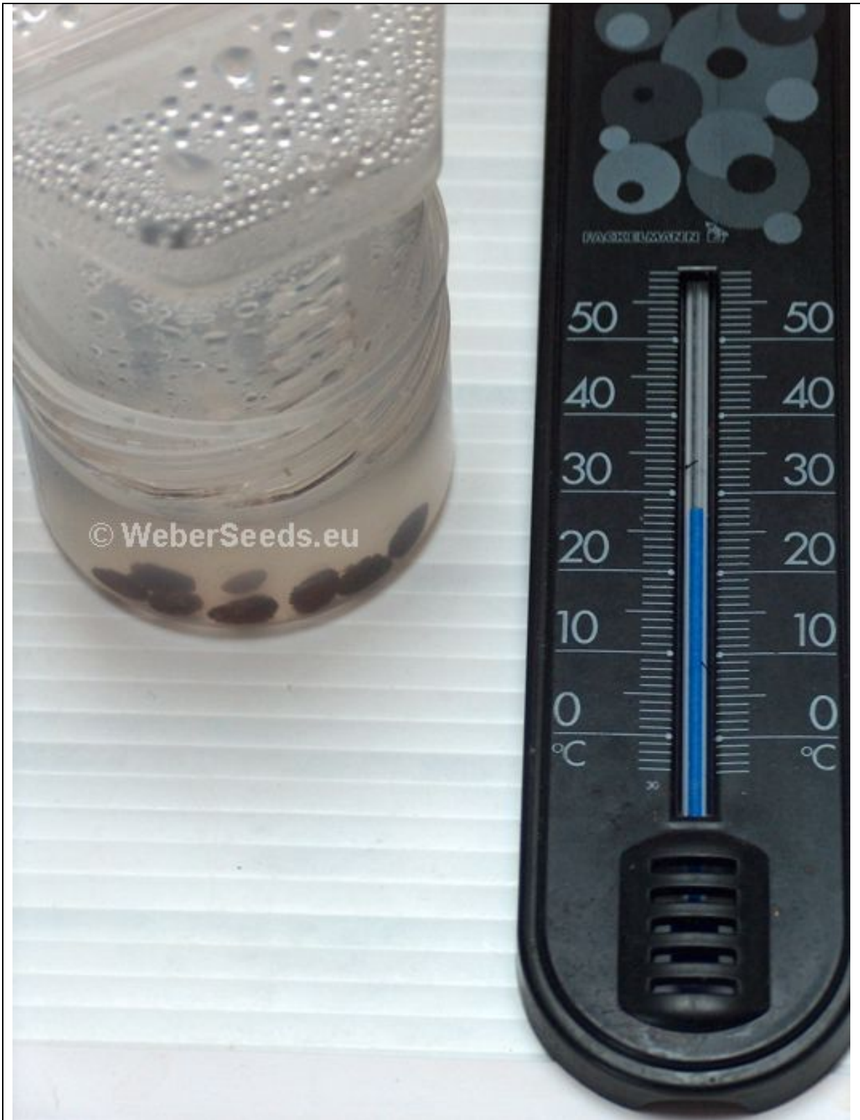
we use a propagator with heating it's perfect