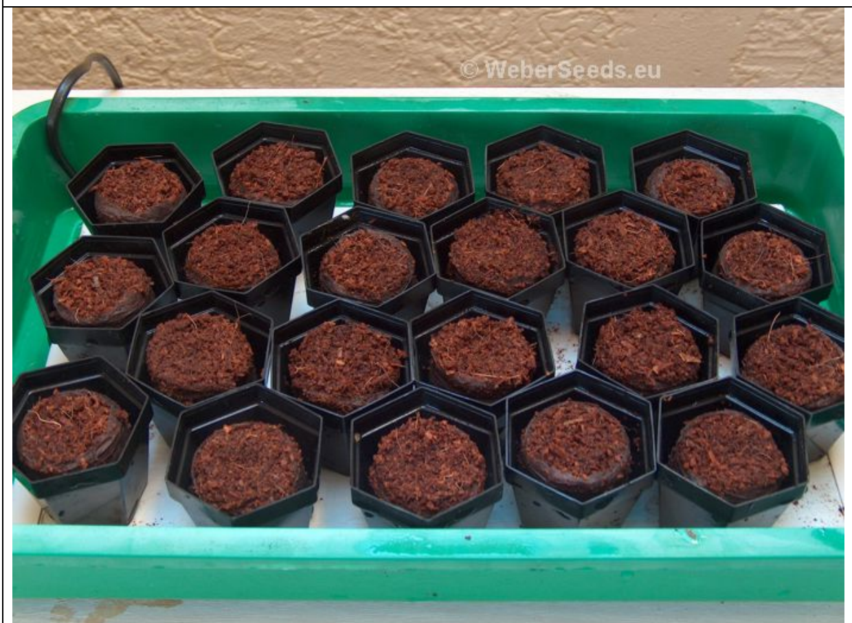
sow the seeds 1cm deep approx and cover with substrate...