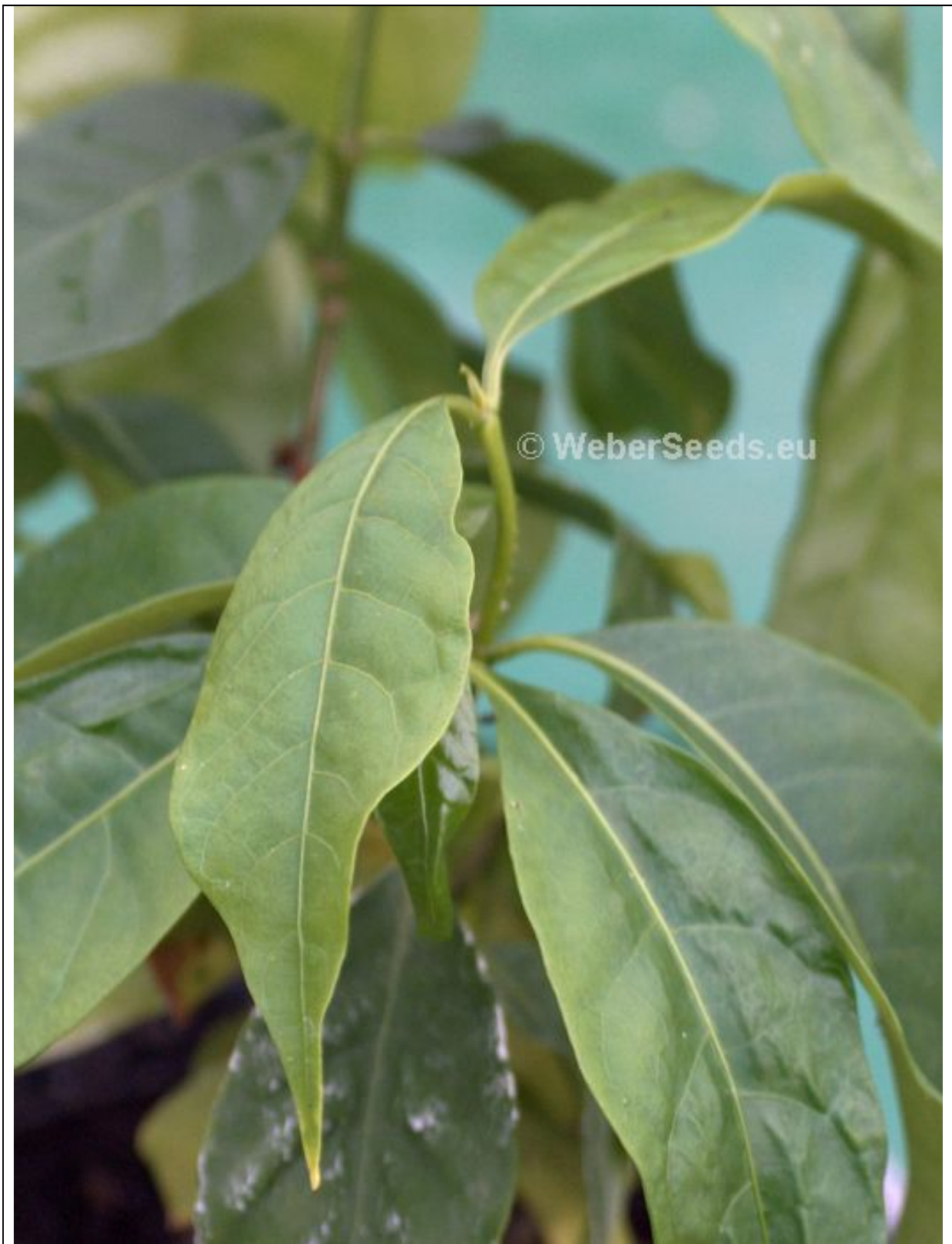
2 years later