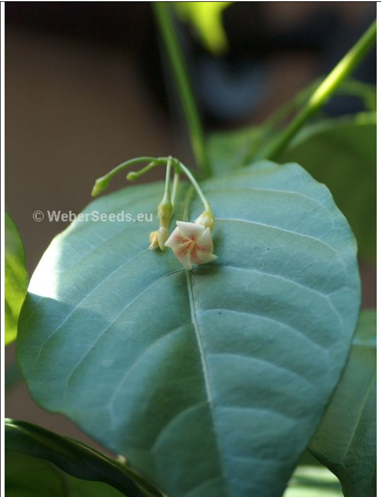
4 years later...flowering