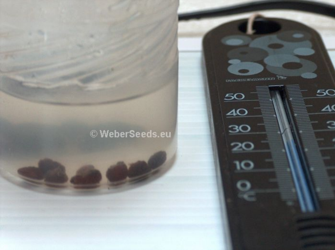
soak the seeds 24h in warm water Water temperature less than 40°C