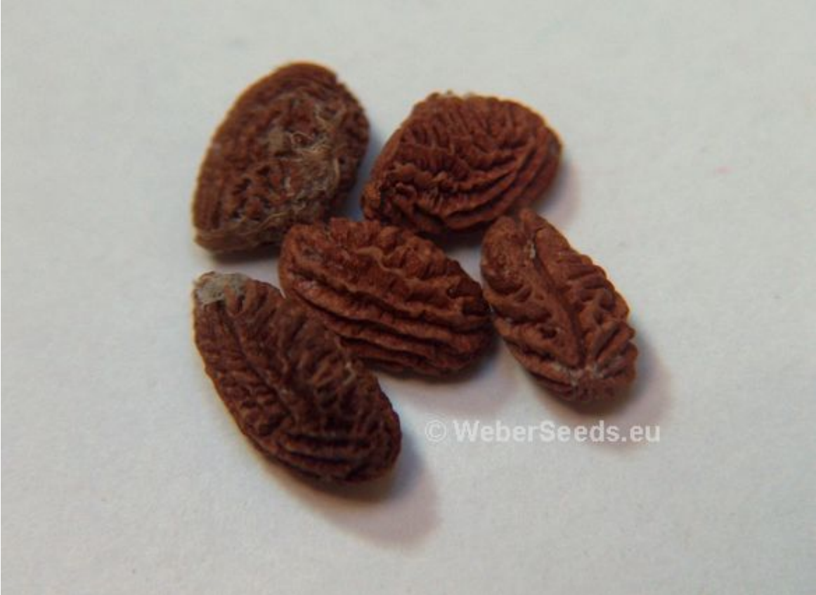
you need viable seeds